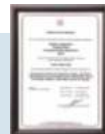
OSHAS 18001 Certification