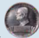
The Deming Prize

Kubota received the Deming Prize which is the highest proof of recognition of major advances in quality improvement. Kubota has also received the ISO9001 Certification which is the international standard of quality management systems, the ISO14001 Certification which is the international standards related to environment management, and the OSHAS 18001 Certification which is the international assessment series of occupational health and safety systems.